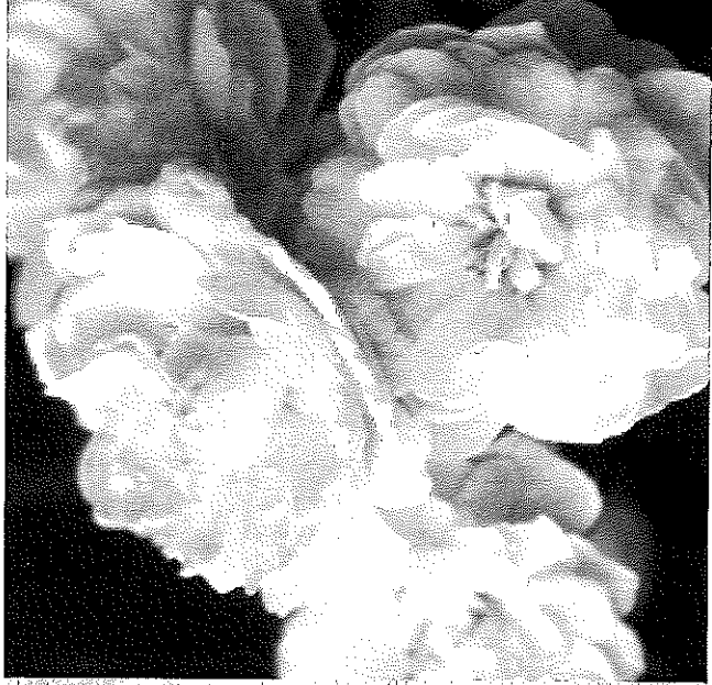
Blush Noisette, photo by Ruth Knopf