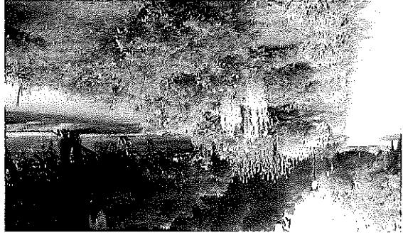
Noisette Study Garden at Hampton Park

Bouquet Tour Fat • Bougainville Champaney's Pink Cluster • Claire Jacquier • Fellenberg "Florida Champaney's Pink Cluster" • Jeanne d'Arc Lamarque • Mary Washington "Mrs. Woods Lavender-Pink Noisette" • Old Blush, China Princess de Nassau • Crepuscule, on fence across Broad Street at Bishop's House