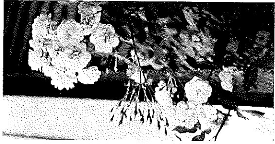
Blush Noisette beside a Charleston piazza